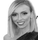
-GIULIANA RANCIC E! NEWS